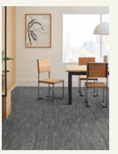
Natural State Collection: Primal

<u>Natural State Collection</u>: Primal and Native are 24 x 24 tiles featuring Solution Q Nylon. Designed for heavy-traffic settings and backed by a 10-year commercial warranty.